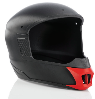
The helmet prototype was 3D printed in one build on the Stratasys F370.