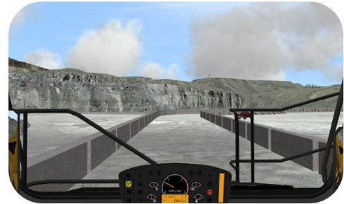
Driving the truck forward avoiding contact with concrete barriers