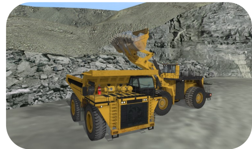
Positioning the Truck for loading by the interactive Wheel Loader