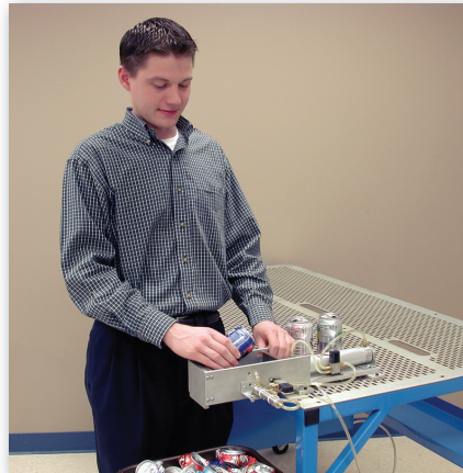
Automated Can Crusher Project Kit (96-PK-MF2)

The Machine Tools Learning Systems are part of Amatrol's Project Based Learning program. The Project Based Learning program allows learners to study industrial concepts and practice hands-on skills in teams across a wide range of learning systems, which culminates with the learners solving a variety of project kits like a hovercraft, automated can crusher, and automated drawbridge. This program was designed for high schools to teach valuable problem-solving, teamwork, and STEM skills and provide a strong base to build toward careers in engineering, manufacturing, and many more.