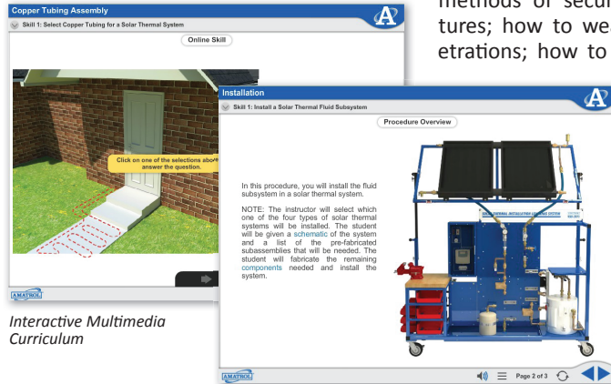
Interactive Multimedia Curriculum

solar thermal fluid components, and electrical components in a solar thermal system; how to install conductors in a solar thermal system; and how to perform an initial startup on a solar thermal system.