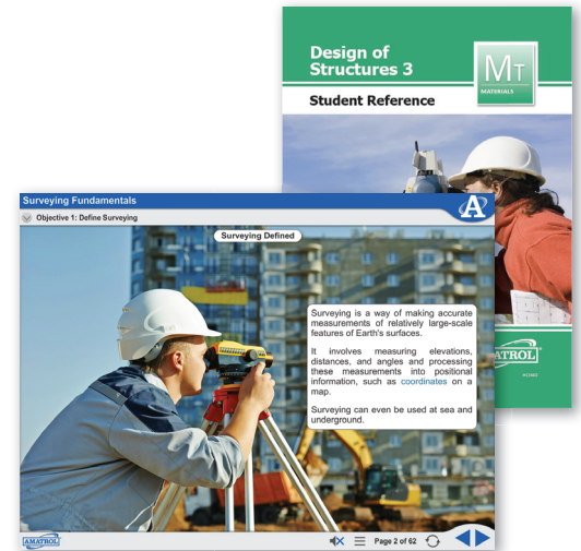
Interactive Multimedia Curriculum and Student Reference Guide