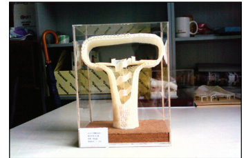
The university selected an Objet 30 Pro 3D printer because it is economical and easy to use