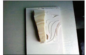
In the past, the university produced CNC and SLA prototypes